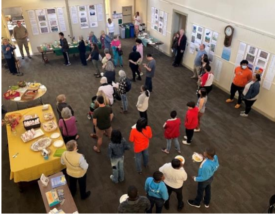
Imagine a Clean Energy Future Opening Reception

Imagine a Clean Energy Future Contest In the Spring of 2023, PSEA sponsored a Student Contest, inviting students in grades 5 – 12 to Imagine a Clean Energy Future. The contest offered 3 categories: Visual Arts, Language Arts and Video. We received 104 entries from 40 different schools across the region. Prizes were awarded in all 3 categories at the Opening Reception for the Exhibition in Center City, Philadelphia. The exhibit was open to the public for more than a month.