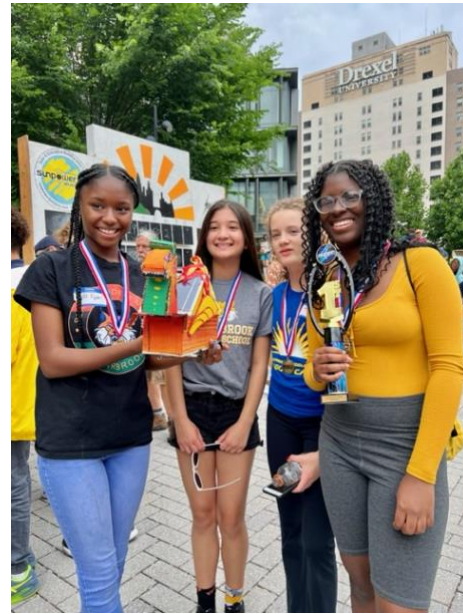
A good day for dragons!