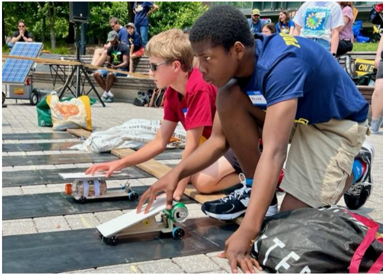
For the win

Philadelphia's Junior Solar Sprint The Philadelphia Solar Energy Association (PSEA) celebrated the 30 th anniversary of our Junior Solar Sprint, by holding another wonderful race on the Drexel University campus! Despite cloudy weather, more than 40 students and 25 enthusiastic volunteers combined to make the day a great success! Not one but two dragon-themed cars won Artistic Merit awards. Some high drama occurred during the final heat, when a car jumped its track, crashed into a competitor and flipped onto the tarmac, while the competitor rolled on to victory. Tours of Drexel's Engineering Labs were very popular again this year.