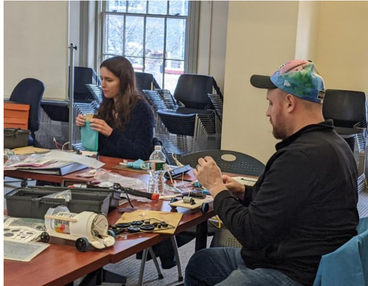
Teachers learn how to build solar cars in preparation for teaching their students.

Teacher Training PSEA held several teacher trainings in preparation for the Sprint.